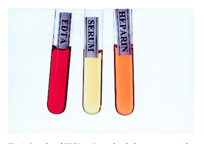
Fig. 2. Samples of EDTA-anticoagulated plasma, serum (gelseparator tube), and heparin-anticoagulated plasma taken from the patient at Day 24.

were discontinued and replaced by vancomycin on Day 14, as drug-induced hemolysis had not yet been excluded. The patient's Hb level stabilized at 80 g per L from Day 14 to 17; however, because her plasma samples remained grossly hemolysed, we transferred the patient's care to the hematology service and she was treated with IVIG and steroids for apparent ongoing intravascular hemolysis. The serum tubes drawn for biochemistry did not show any evidence of hemolysis after Day 14. This information was unavailable to us because these samples were processed at another hospital campus. We became aware of this discrepancy on Day 19 when the blood bank requested both serum and plasma samples.