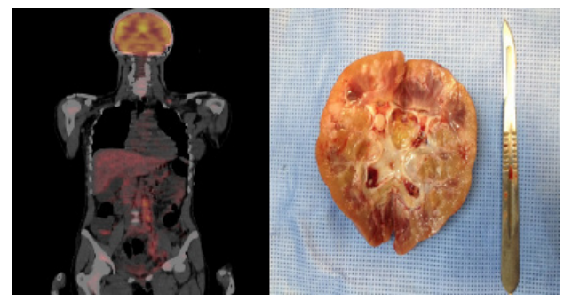
Figure 1. Transmitted tumor seen in surgical specimen and its node metastasis in PET-CT.

PET-CT scan demonstrated a low to moderate uptake in supraclavicular and retroperitoneal nodes (SUVmax 3.5), and a fine needle biopsy confirmed metastatic carcinoma. Liver and lungs had no signs of metastatic disease and no serum tumor markers were increased. Patient underwent to transplantectomy and no superficial alteration was seen in the graft. After removal, whole kidney was sent to pathological analysis (Figure 1) that confirmed a poorly differentiated, mucinous adenocarcinoma with signet ring cells, infiltrating the renal parenchyma. Any other oncologic treatment was offered, but transplantectomy and withdrawal of immunosuppressive agents. Since then, the patient did not manifest any disease symptoms and has experienced gradual reduction of nodal metastatic lesions. Patient is currently without disease evidence, completing 1 year of follow up.