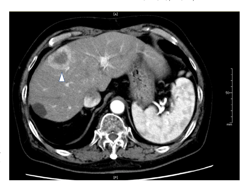
Fig 1. Abdominal enhanced computed tomography scans 3 years and 5 months after liver transplantation. A 40-mm tumor with ringshaped contrast effect in liver segment 8 in the early phase (white arrowhead).

was discharged on postoperative day 48. Histopathologic examination of the explants revealed 9 lesions with a maximum diameter of 2.2 cm.